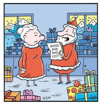
"Apparently there's no good or bad children anymore...only misunderstood!"