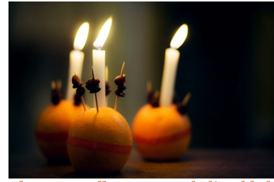
(20 - Good, 30 - Excellent, 40 - Unbelievably brilliant!)